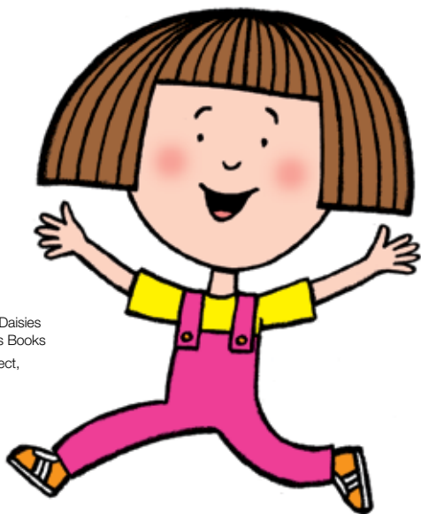
Girl (Daisy), from A Bunch of Daisies written by Kes Gray, Random House Children's Books See Members' News, The Showstoppers Project, page 5