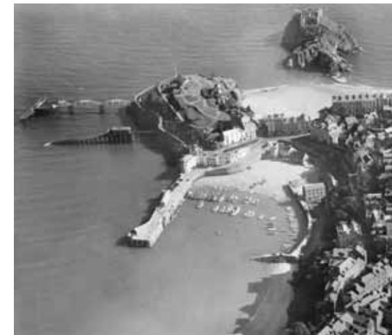
The Harbour, Castle Hill and St Catherine's Rocks, Tenby, Pembrokeshire September 1929

The partners therefore decided to devise a small inexpensive touring show in addition to our major exhibitions. The idea being that this could be shown in multiple locations across Britain at any one time without major administrative difficulties. The touring offer consists of 30 stunning Aerofilms images of which 12 are 'generic' to the project and the remaining 18 images are tailored to the country in which they are shown. For Wales bi-lingual exhibition captions and interpretation panels have also been prepared. There is also a digital slide show available that features more images from the collection with the option to add in further images specific to the venue.