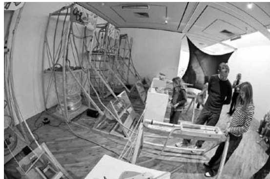
Fabulous Sound Machines exhibition