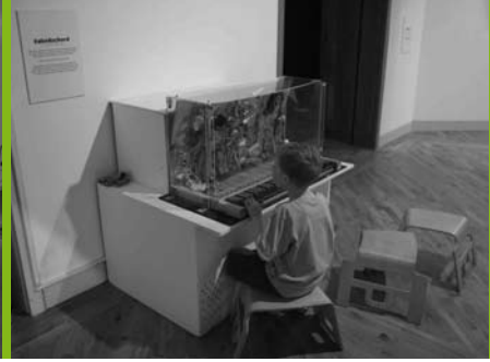
Fabulous Sound Machines exhibition