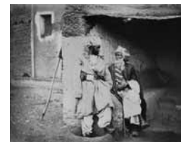
B Simpson, The Horse Sellers, 1881

Hire fee: 1,000 Transport: Hirer both ways Size: M Available: 06.07 onwards