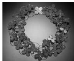
Marjorie Simon, Flower Necklace

Hire fee: £2,000 Size: S Available: 11.08 onwards