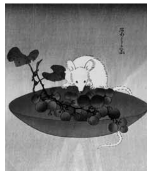
Hasoda Yeishi, Rat with Dish of Grapes

Hire fee: £550 Transport: Hirer Size: S Flexible layout Available: 05.07 onwards (8 week slots)