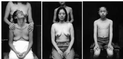
He Chengyao, Testimony , Colour photographs, 127 x 78cm (triptych)

Hire fee: tbc Size: S Available: 07.07 onwards