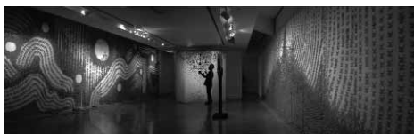
Lu Shengzhong, Realm of Great Peace , paper 2003