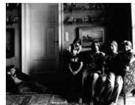
Jungs, Living Room, Schönstadt (from the series Them, Growing ) by Anna Bauer, 2005 © the artist. Image from Photographic Portrait Prize 2006