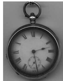
Titanic Pocket Watch, Titanic Honour & Glory

Featuring many rare artefacts until now seen only by Titanic's crew and passengers, including the millionaires who travelled on the fateful maiden voyage in April 1912. The stunning artefacts range from dinner plates which served the first meals onboard to a silver pocket watch, badly water damaged and recovered from a victim of the sinking. Experience what it was like to be onboard