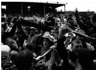
We're Back! Hibernian fans celebrate promotion back to the SPL

Hire fee: £250 Transport: SFM Size: S Wall mountable or portable display walls supplied Available: 05.07-03.09 to venues in Scotland only